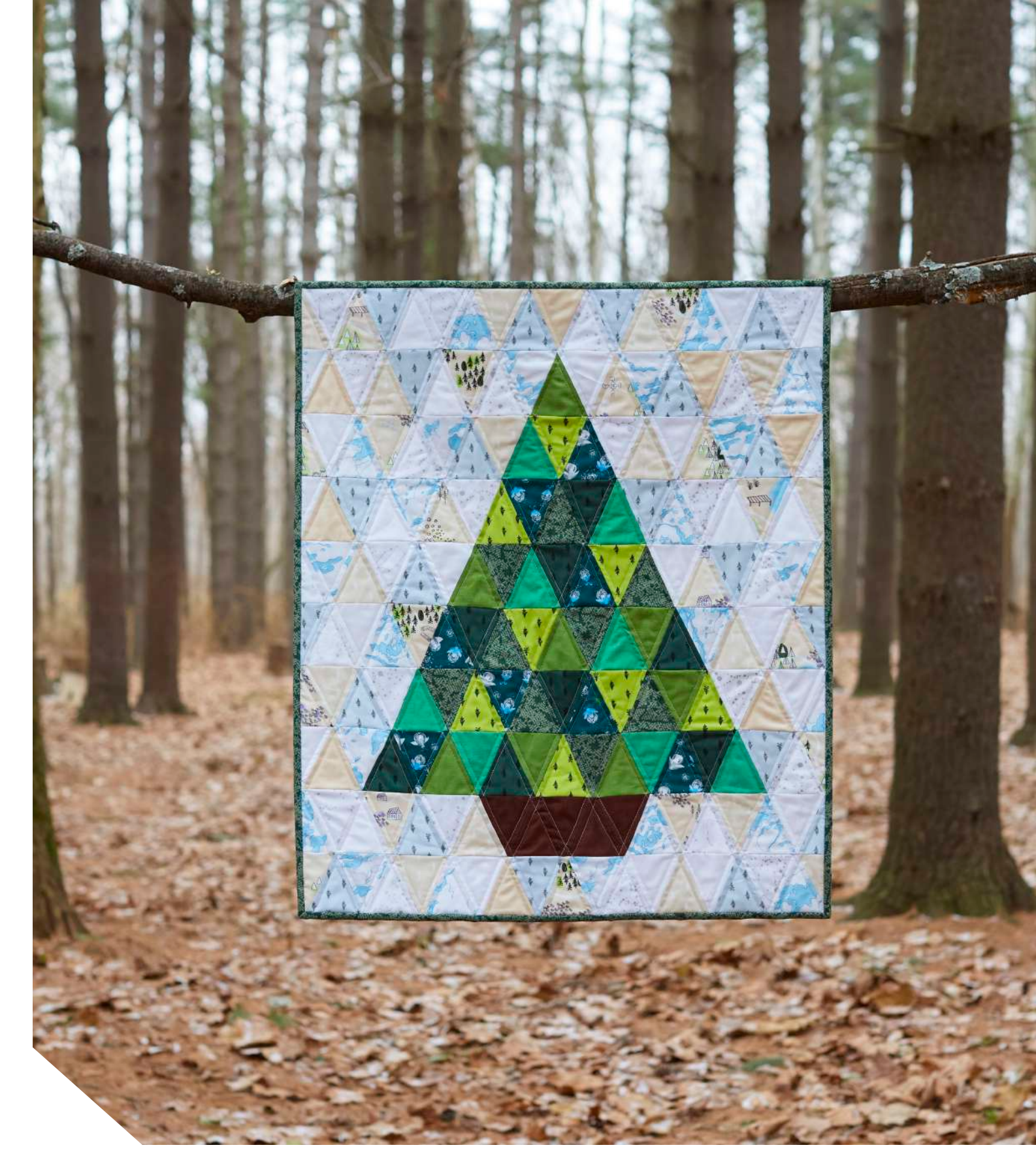
O Christmas Tree (24" x 30") by Material Girl Quilts PATTERN FOR SALE: MATERIALGIRLQUILTS. BIGCARTEL. COM